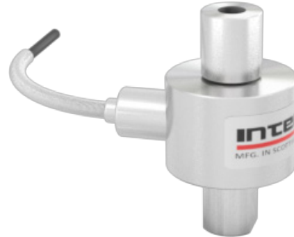
Model WMCFP (Shown)