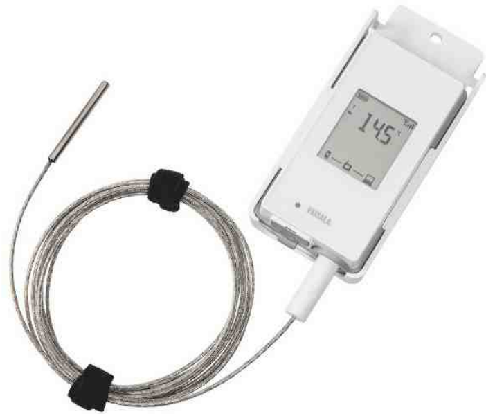
The RFL100 Wireless Temperature Data Logger uses VaiNet proprietary wireless technology to connect to viewLinc. Shown with probe extension cable. RFL-Series data loggers come in temperature only or temperature and humidity models.