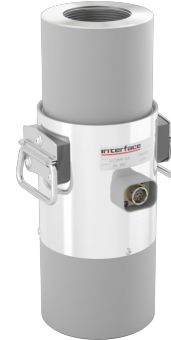
Model 2200 (Shown)