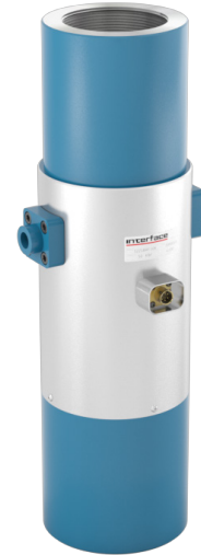
Model 2160 (Shown)