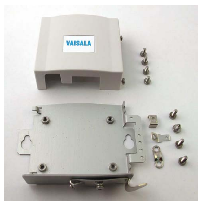
Figure 1 Mounting Bracket Parts