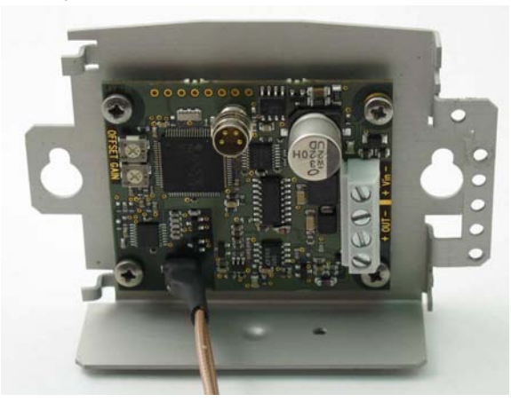
Figure 2 Module Mounted in the Bracket

1. Attach the module to the bracket with four screws; see Figure 2.